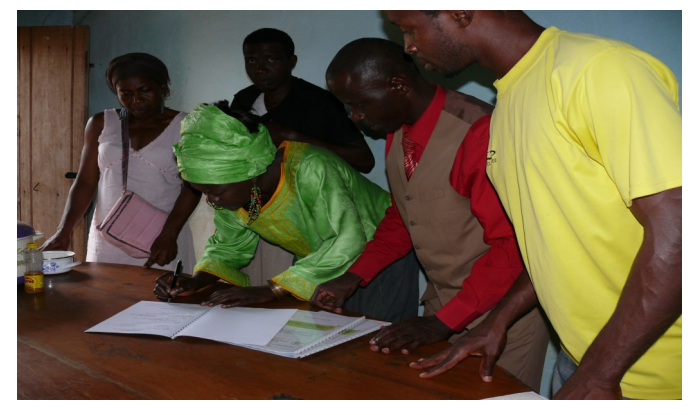
Joint signature of statute with the executive board of CDAS-BC association and the commissions