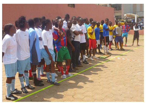
Steet Soccer championship at Nkoldongo, goal: fom the national team of Cameroon Dez 2015